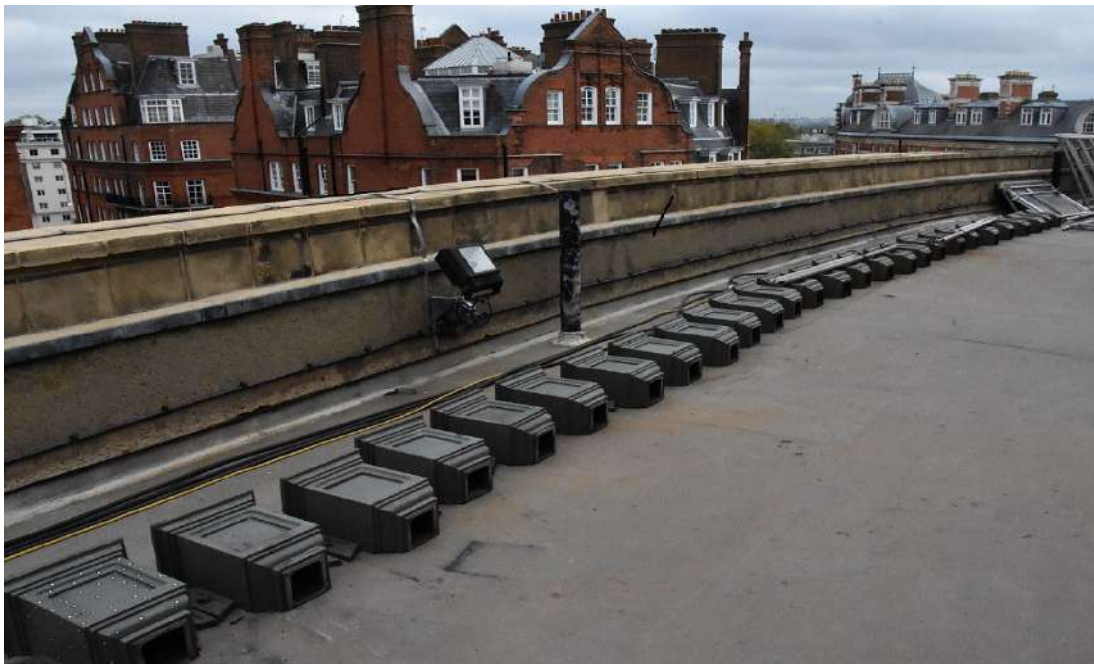
(Image) Hopper heads removed & kept by RAH (Note: Hopper bottom left with laser markings for casting)

The works involved pre-start meetings to ensure good communications, implementation of a first class Health & Safety plan and production of bespoke replicated Cast iron rainwater goods to, not only match the original features, but to deliver an enhanced product, overcoming original shortcomings in functionality & design.